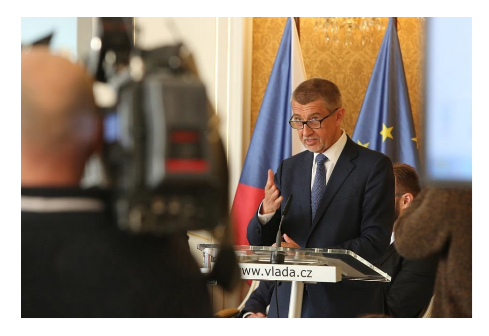
Opening conference address by Prime Minister Babiš, Liechtenstein Palace, Prague.

"I am glad we finally have a clear innovation strategy with the aim of catching up with countries such as Sweden, Denmark, Switzerland and Finland, who chose to promote innovation fifteen years ago and are now among the most prosperous countries in the world," said Prime Minister Andrej Babiš about the importance of the newly introduced Czech Innovation Strategy.